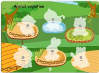
TITLE CARD * 16 PAGES