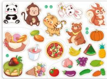
ACCESSORIES * 4 PAGES