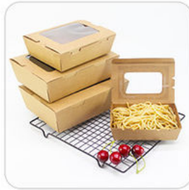
Kraft paper lunch box