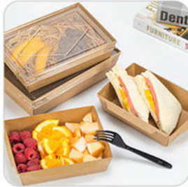
Kraft paper lunch box