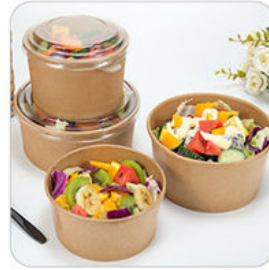
Kraft paper bowl