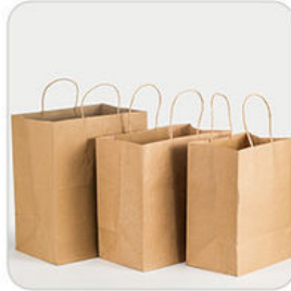
Kraft paper bag