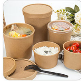
Kraft paper soup cup