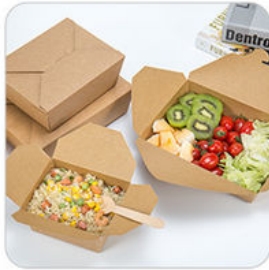
Kraft paper lunch box