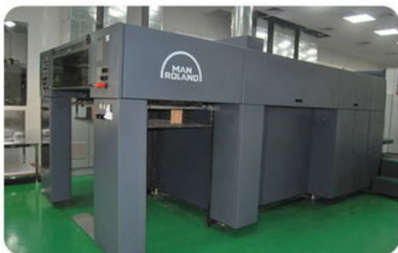
MAN ROLAND 7+1 UV PRINTING