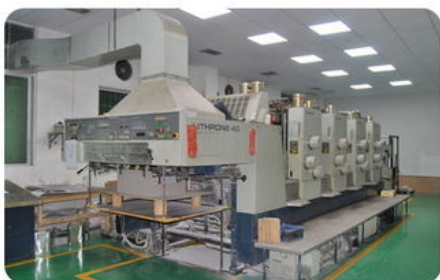
KOMORI CMYK PRINTING MACHINE