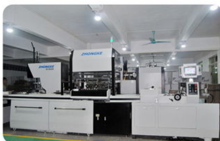
RIGID BOX AUTOMATIC MAKING MACHINE