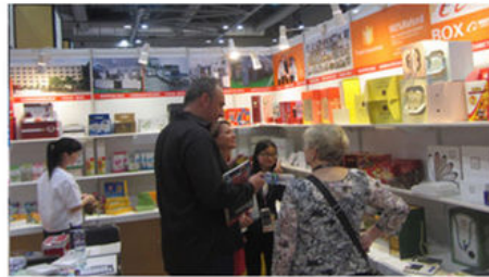
HK trade show