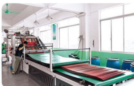
CORRUGATED PAPER BOARD MOUNTED