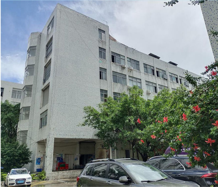
Our Factory Building.

Shenzhen Linglongrui Packaging Products Co., Ltd.