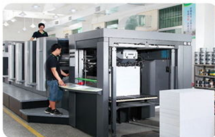
HEIDELBERG CMYK PRINTING MACHINE