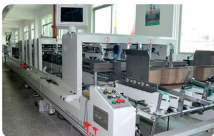
BOTTOM AND SIDE AUTOMATIC GLUING