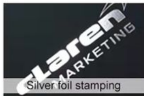
Silver foil stamping