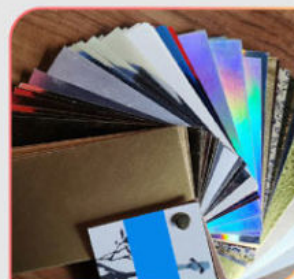
Gold And Silver Cardboard