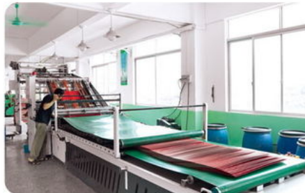
CORRUGATED PAPER BOARD MOUNTED