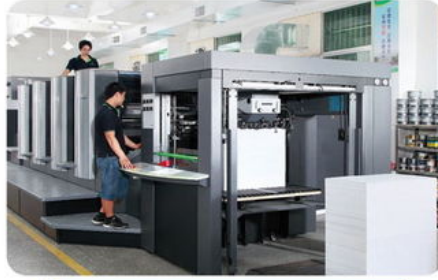
HEIDELBERG CMYK PRINTING MACHINE