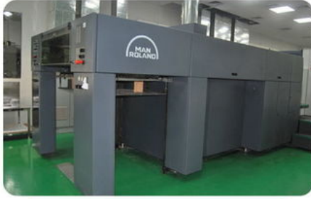
MAN ROLAND 7+1 UV PRINTING