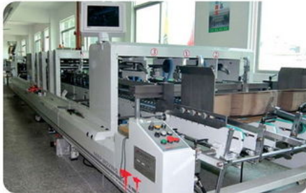
BOTTOM AND SIDE AUTOMATIC GLUING