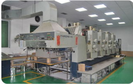
KOMORI CMYK PRINTING MACHINE