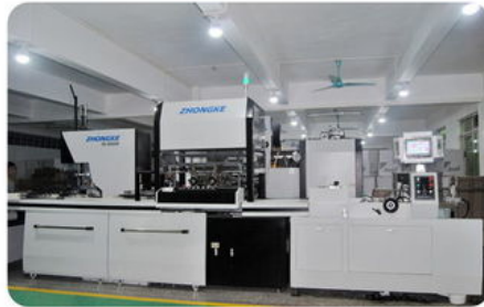
RIGID BOX AUTOMATIC MAKING MACHINE