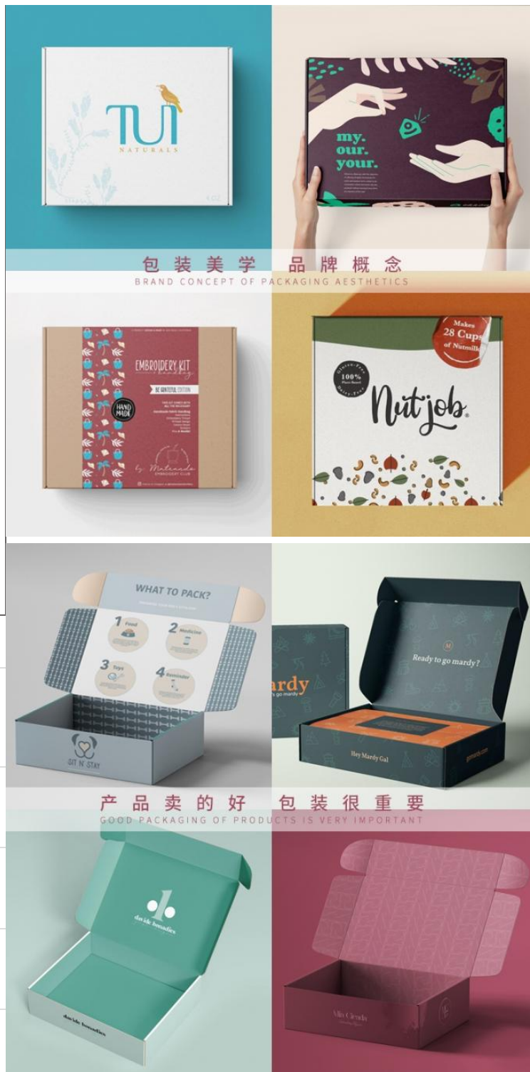
包装美学 品牌概念 BRAND CONCEPT OF PACKAGING AESTHETICS