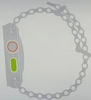
2 设计 Apple Watch 2， 添加智能手表功能。