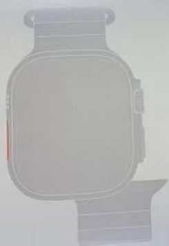
1 设计智能手表，添加智能手表 功能如 Apple Watch 2。