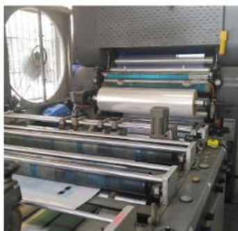
Automatic glue passing machine