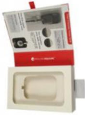
Electronic Packaging Box ▶