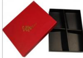
Chocolate Box ▶