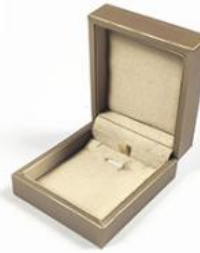
Jewelry box ▶