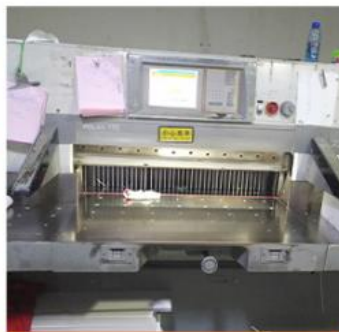
Paper cutting machine