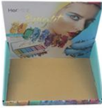
Display Racks ▶