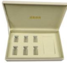
Cosmetics Box ▶