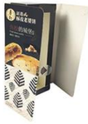
Cake Box ▶