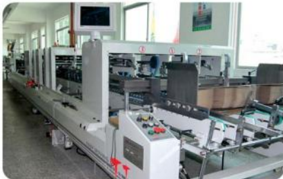
BOTTOM AND SIDE AUTOMATIC GLUING