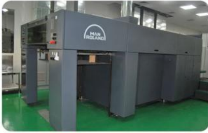
MAN ROLAND 7+1 UV PRINTING