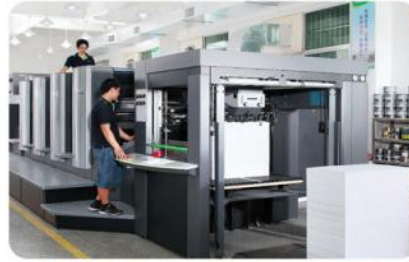
HEIDELBERG CMYK PRINTING MACHINE