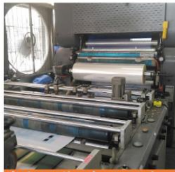
Automatic glue passing machine