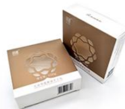
Soap Box Packaging