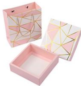
Perfume Gift Box