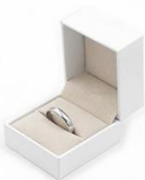
Jewelry Packaging Box