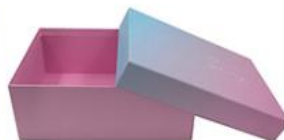
Shoe Packaging Box