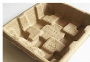
PAPER PULP TRAY