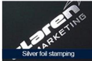
Silver foil stamping