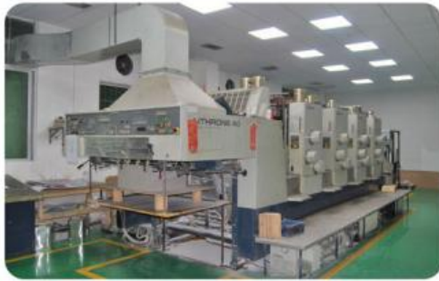
KOMORI CMYK PRINTING MACHINE