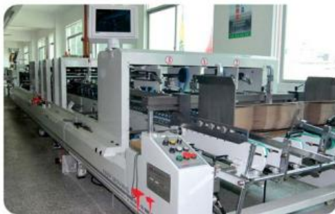
BOTTOM AND SIDE AUTOMATIC GLUING