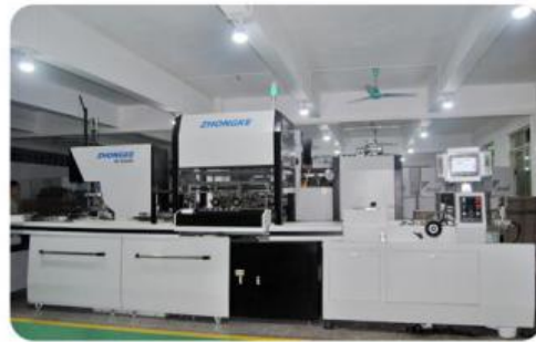
RIGID BOX AUTOMATIC MAKING MACHINE