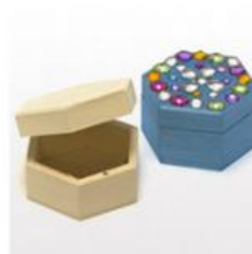
Custom Shape BOX