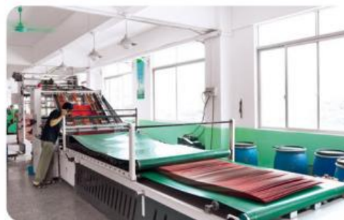
CORRUGATED PAPER BOARD MOUNTED