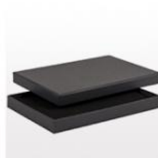
Removable lid box