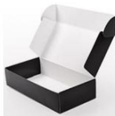
Tuck end box