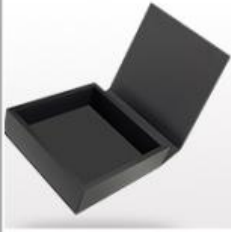
Book style boxes