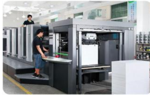
HEIDELBERG CMYK PRINTING MACHINE