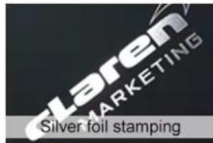
Silver foil stamping