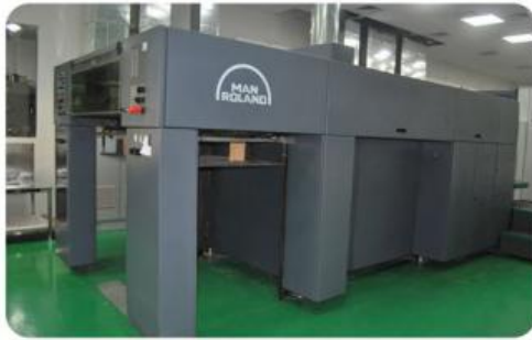
MAN ROLAND 7+1 UV PRINTING