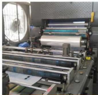
Automatic glue passing machine