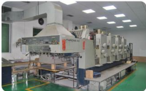
KOMORI CMYK PRINTING MACHINE