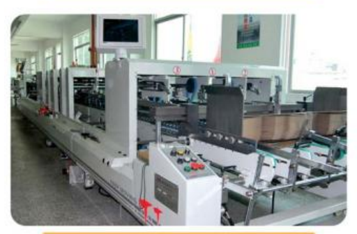
BOTTOM AND SIDE AUTOMATIC GLUING