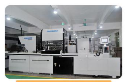
RIGID BOX AUTOMATIC MAKING MACHINE