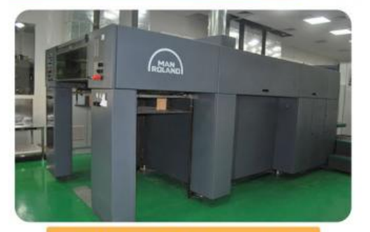
MAN ROLAND 7+1 LIV PRINTING