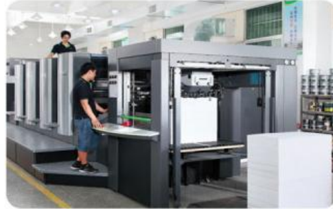
HEIDELBERG CMYK PRINTING MACHINE