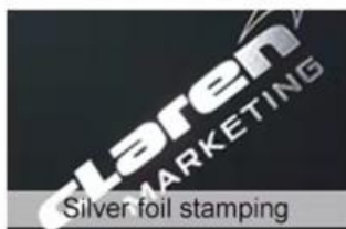
Silver foil stamping