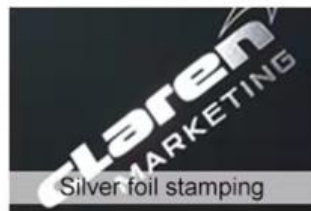
Silver foil stamping