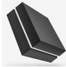
Removable lid box with neck