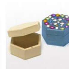
Custom Shape BOX