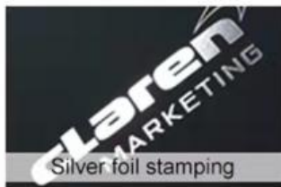
Silver foil stamping